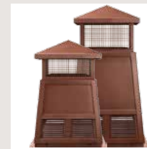
VERTICAL VENTING GAS SHROUD OR WOOD TERMINATION CAP

DTO134-CP/DTO146-CP (For gas use with DVP-TVHW/TV or SLP-TVHW, for wood use with SL300 series pipe - requires CT-3A, SL1100 series pipe - requires CT-11A, Durachimney II pipe - requires CT-14A)