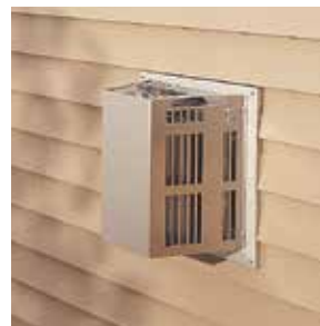
HORIZONTAL VENTING GAS SHROUD

DRC-RADIUS (For use with DVP-TRAP1, DVP-TRAP2, SLP-TRAP1 or SLP-TRAP2)