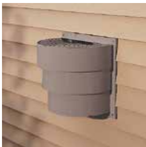
HORIZONTAL VENTING GAS SHROUD