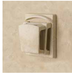
HORIZONTAL VENTING GAS TERMINATION CAP

DVP-TRAP1/DVP-TRAP2/SLP-TRAP1/ SLP-TRAP2/SLP-HHW2