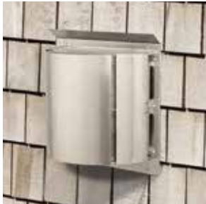
HORIZONTAL VENTING GAS TERMINATION CAP