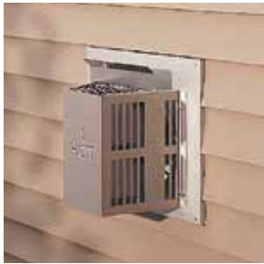
HORIZONTAL VENTING GAS TERMINATION CAP