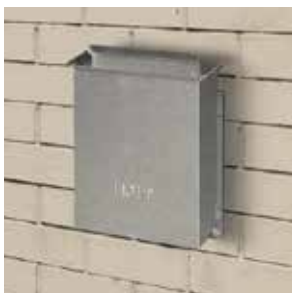
HORIZONTAL VENTING GAS TERMINATION CAP