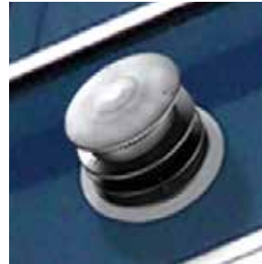
HORIZONTAL VENTING GAS TERMINATION CAP