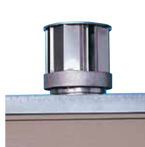
VERTICAL VENTING GAS TERMINATION CAP