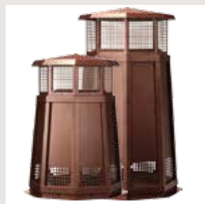
VERTICAL VENTING GAS SHROUD OR WOOD TERMINATION CAP