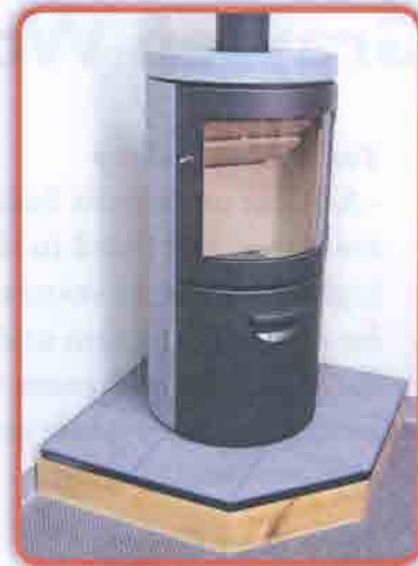
(Left) Natural finish Pine Riser and a North Slope Hearth Pad.