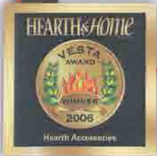
(Above) 2006 Vesta Award winning Carolina Hearth Enhancer in Cherry with Fruitwood finish and Vintage-Style Makah Hearth Pad.