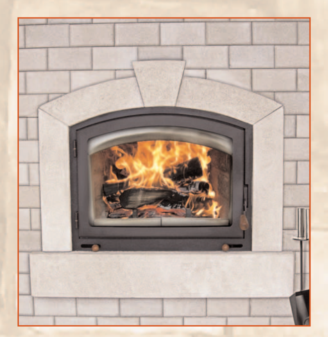
Chameleon Clean Facing, Black Door

The Chameleon was the first EPA certified stove to permit the installation of a non-combustible facing up to the door with no grills or louvers in the immediate area around the opening. This popular "clean face masonry" look is now available as an option on the Delta and Opel fireplaces as well.