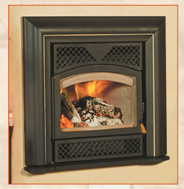
Topaz - Black Door, Louvers & Extrusions

The Topaz incorporates a unique facade which eliminates the need for any non-combustible facing whatsoever making it the easiest and most flexible unit on the market to finish.