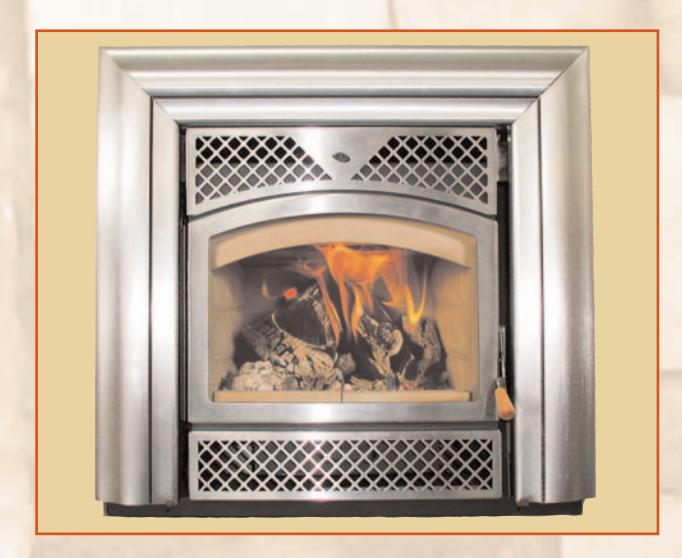
Topaz - Pewter Door, Louvers & Extrusions

A fireplace is one of the most sought after features in a home and will increase its resale value much more than a freestanding stove. A Built-In-Stove gives you the best of both worlds.