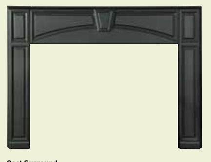
Cast Surround Available for the Voyageur Grand and Voyageur in black or porcelain mahogany